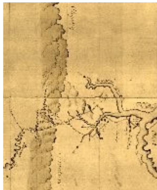
Washington to Fort Le Boeuf, 1754